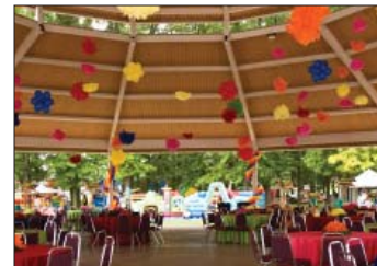
Pavilion - Gazebo