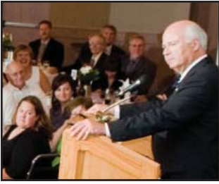
CBC News Anchor, Peter Mansbridge speaks at Club Roma for a corporate event.

For close to 50 years, all types of groups in Niagara have enjoyed meeting at Club Roma. For instance, the Grape Growers of Ontario host the annual Scotiabank Celebrity Lunch in September, as shown here with Peter Mansbridge as the keynote speaker in 2009.