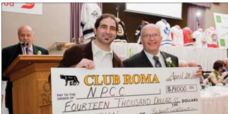
COMMUNITY & CHARITY EVENTS