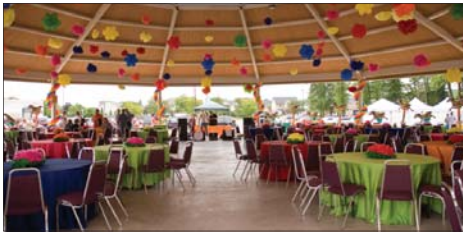
PICNICS AND OUTDOOR EVENTS