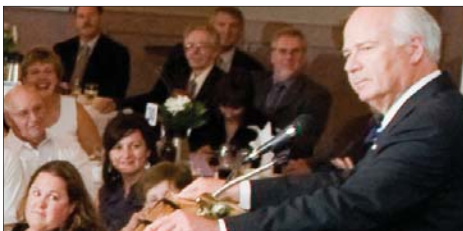
CORPORATE MEETINGS AND EVENTS