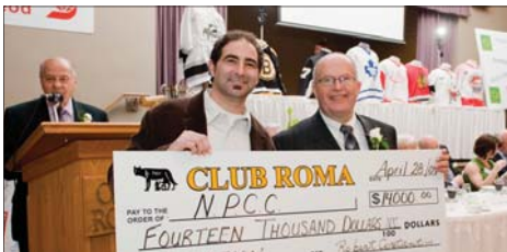
COMMUNITY & CHARITY EVENTS