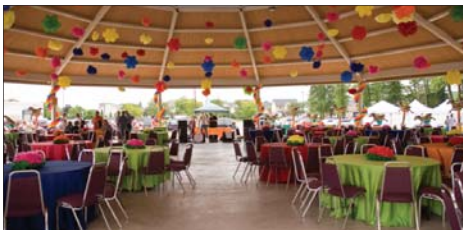
PICNICS AND OUTDOOR EVENTS