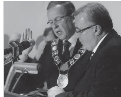
St. Catharines Mayor Brian McMullan takes oath of office in January 2011.