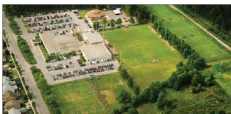
PICNICS AND OUTDOOR EVENTS