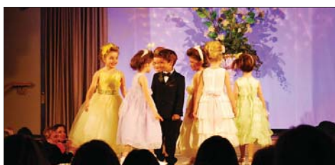
COMMUNITY & CHARITY EVENTS