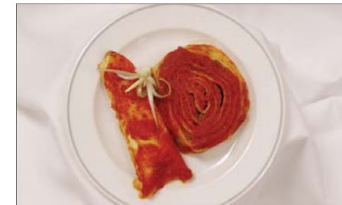
FRESH HAND-MADE PASTA