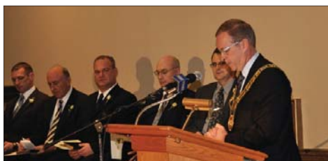
CORPORATE MEETINGS AND EVENTS