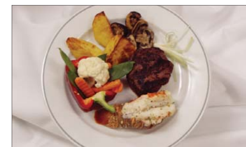
SUCCULENT STEAKS & SEAFOOD